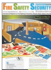
FIRE SAFETY SECURITY INTERNATIONAL International Trade Supplement