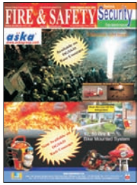
FIRE & SAFETY Monthly Magazine