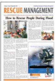
RESCUE MANAGEMENT Monthly Magazine