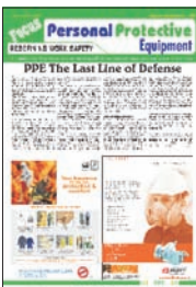
FOCUS PERSONAL PROTECTIVE EQUIPMENT Monthly Magazine